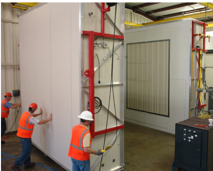
The Butler Guarded Hot Box tested actual in-place performance of the EX Wall Systems.

The BlueScope Guarded Hot Box precisely measures thermal conductance through insulated roof and wall system assemblies, which helps our research and development team create more sustainable, energy-efficient buildings.